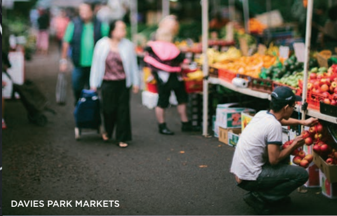
DAVIES PARK MARKETS