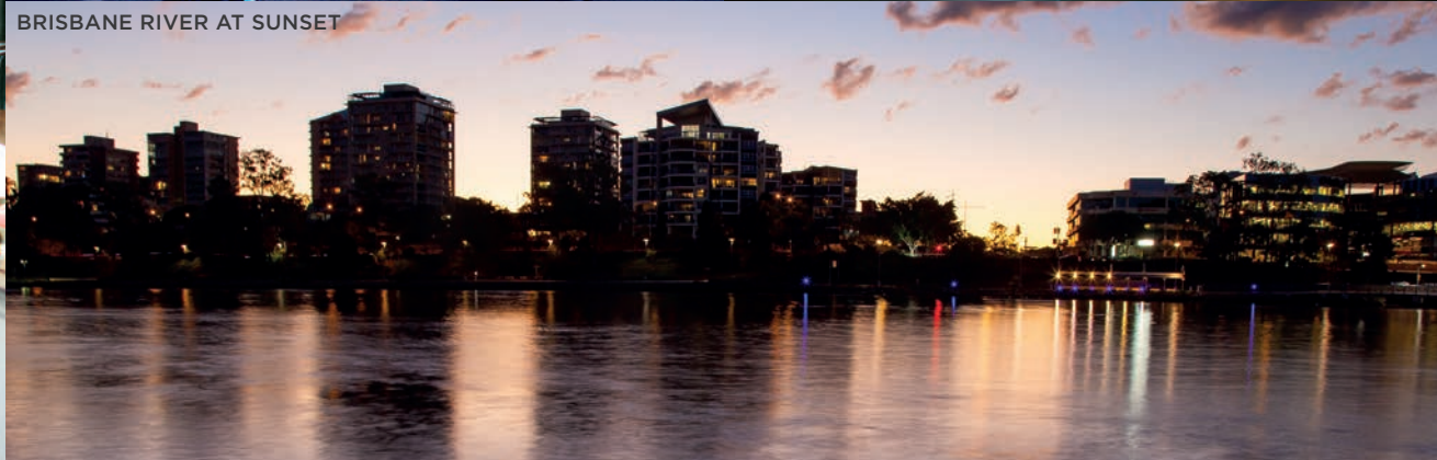
BRISBANE RIVER AT SUNSET