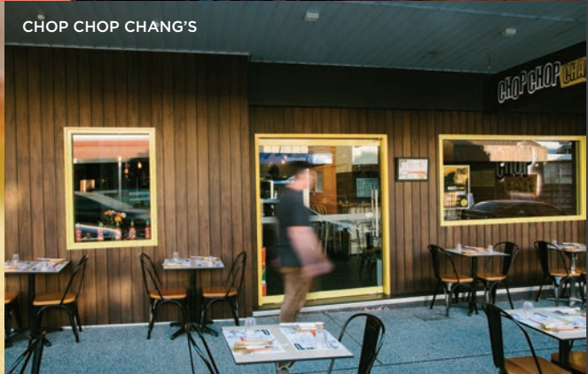
CHOP CHOP CHANG'S