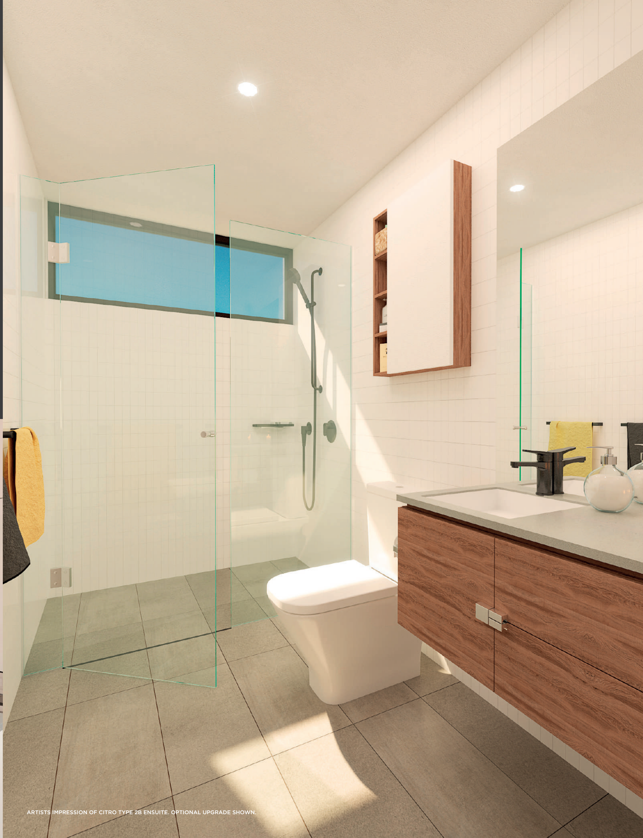
ARTISTS IMPRESSION OF CITRO TYPE 2B ENSUITE. OPTIONAL UPGRADE SHOWN.