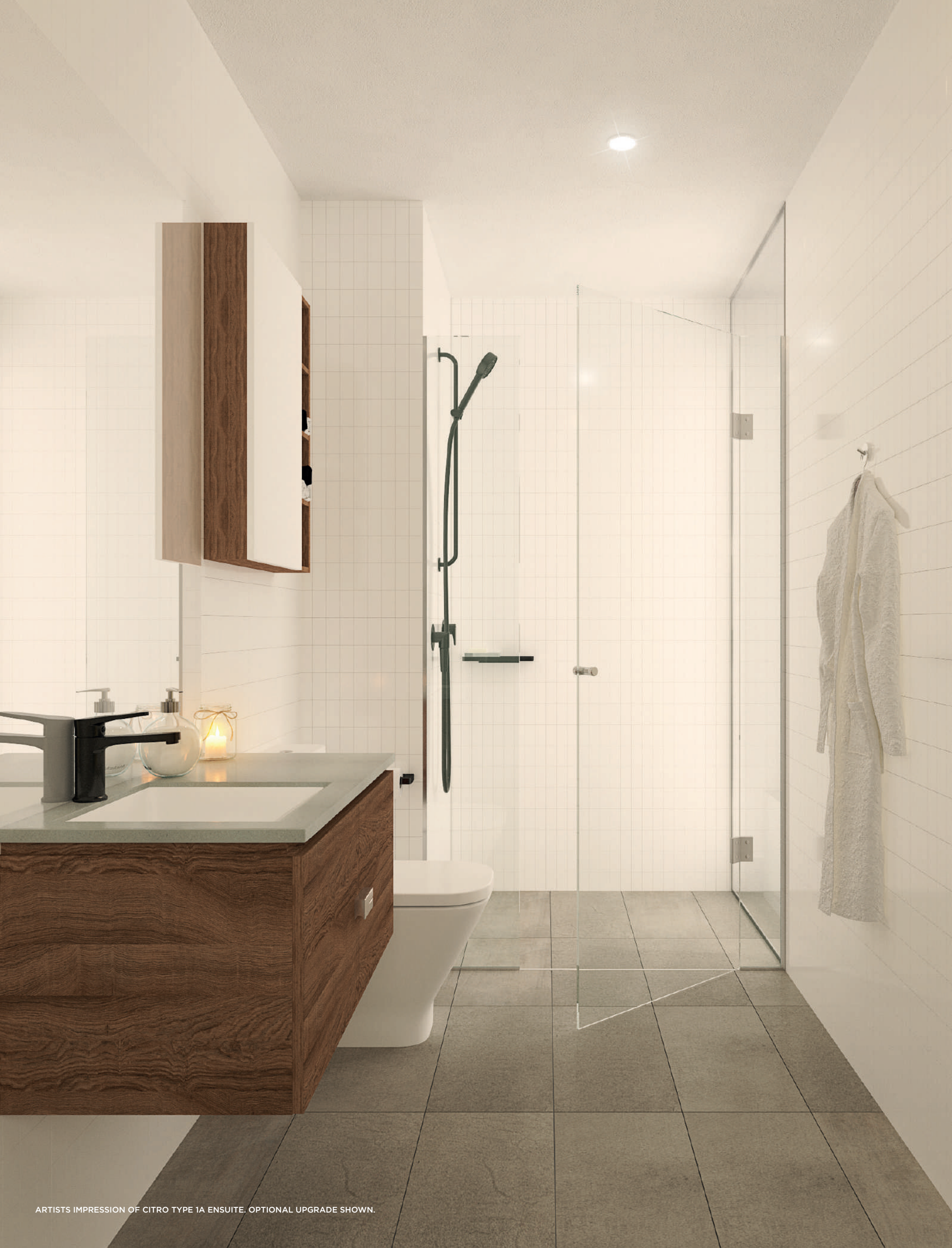
ARTISTS IMPRESSION OF CITRO TYPE 1A ENSUITE. OPTIONAL UPGRADE SHOWN.