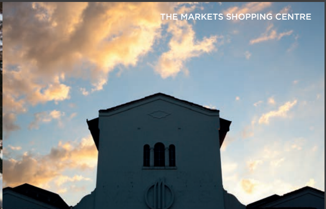
THE MARKETS SHOPPING CENTRE