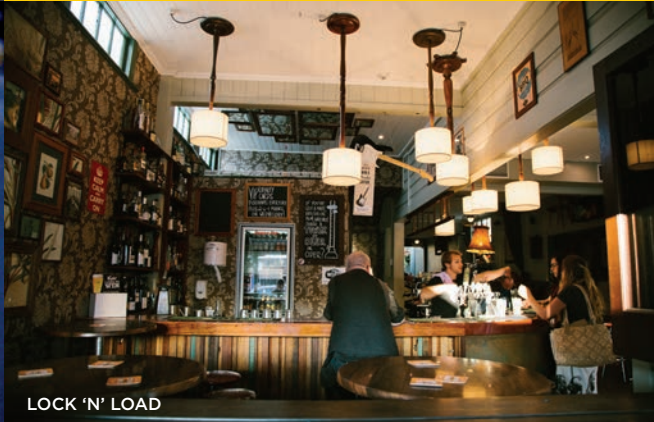
LOCK 'N' LOAD