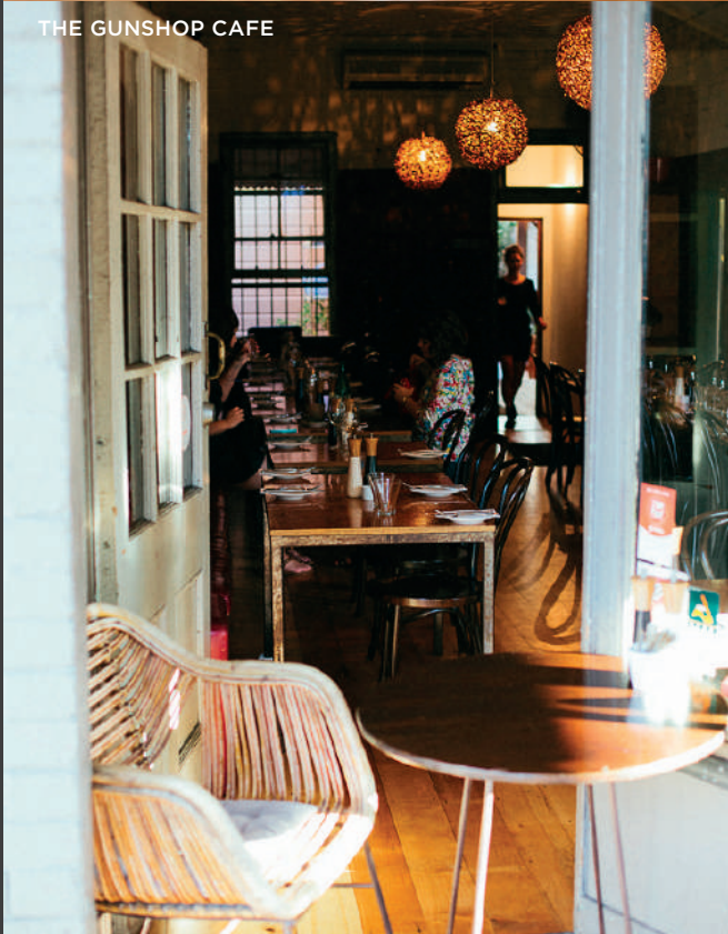
THE GUNSHOP CAFE