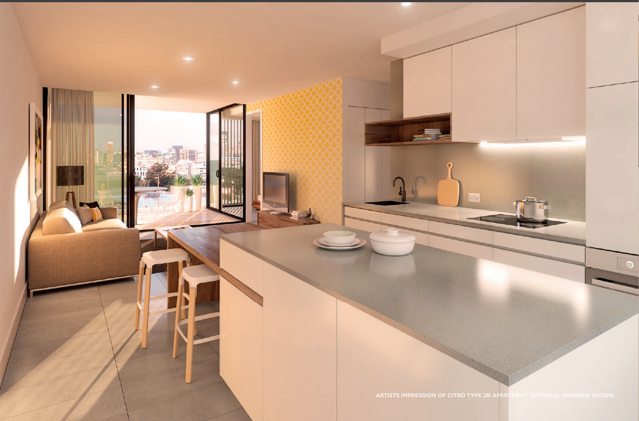
ARTISTS IMPRESSION OF CITRO TYPE 2B APARTMENT. OPTIONAL UPGRADE SHOWN.

CITROTWO comprises two equally stylish two bedroom floor plans, each created to provide a spacious living option. With a choice of warm timber flooring or a contemporary ceramic tile finish, the floor plans include a generous balcony with views north and south across all levels. The balcony is accessed via the open living area and master bedroom. An open plan kitchen with an eat-in island bench has been designed to create a sense of integrated living, while smooth finishes provide elegance, simplicity and sophistication to the spaces.