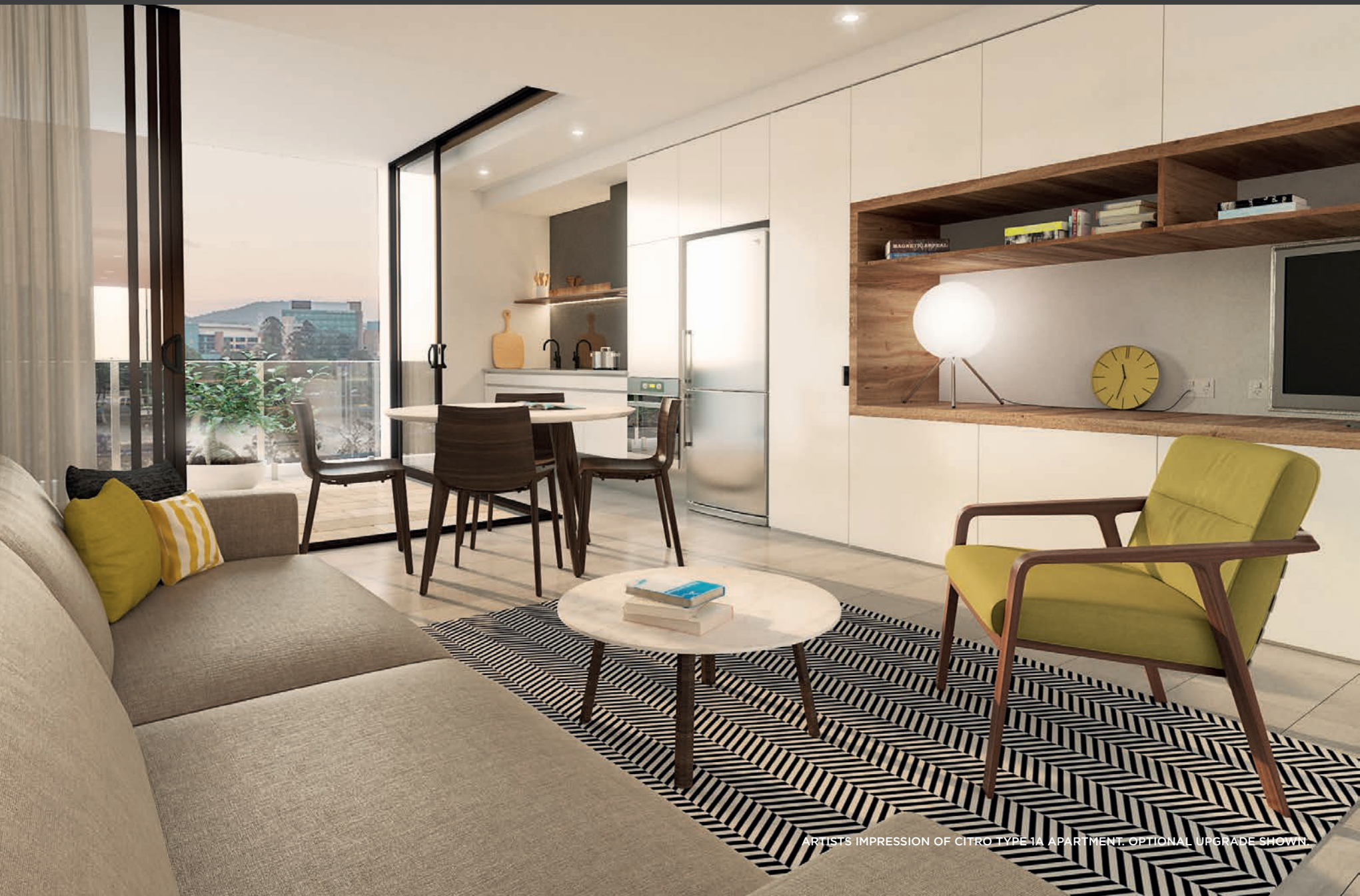
ARTISTS IMPRESSION OF CITRO TYPE 1A APARTMENT. OPTIONAL UPGRADE SHOWN.

CITROONE offers a fresh, exciting and urban sanctuary from busy lives and an affordable slice of luxury for people on the go. Available with either timber flooring, or modern ceramic, the stunning one bedroom apartments provide a classic linear flow and excellent flexibility in layout. Full height glazing, alfresco space - each apartment is designed to maximise Brisbane's sub tropical environment.