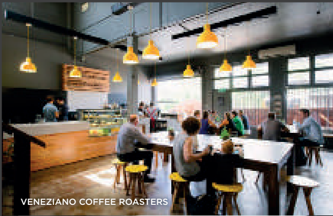
VENEZIANO COFFEE ROASTERS